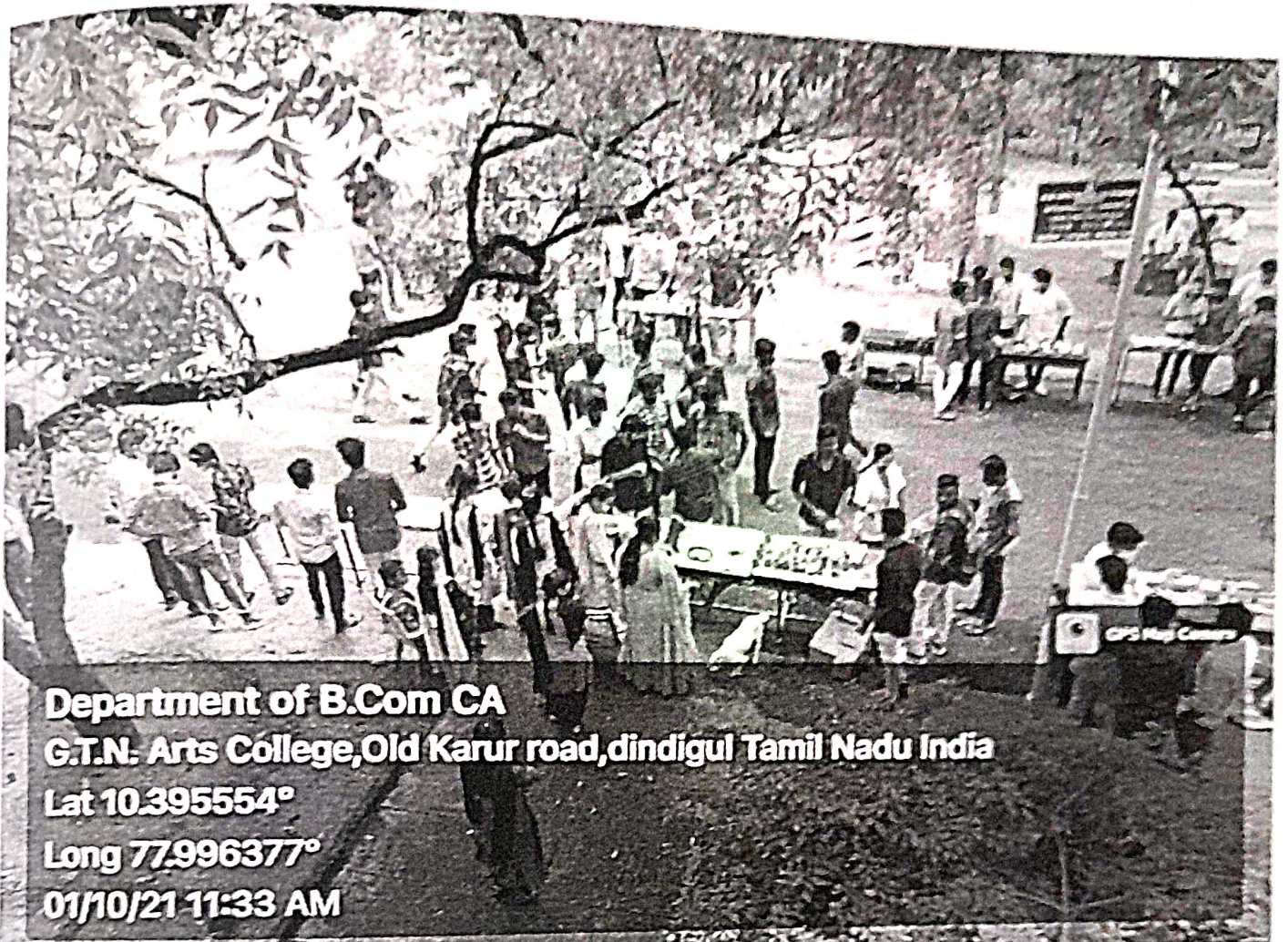
Department of B.Com CA G.T.N. Arts College, Old Karur road, dindigul Tamil Nadu India Lat 10.395554° Long 77.996377° 01/10/21 11:33 AM